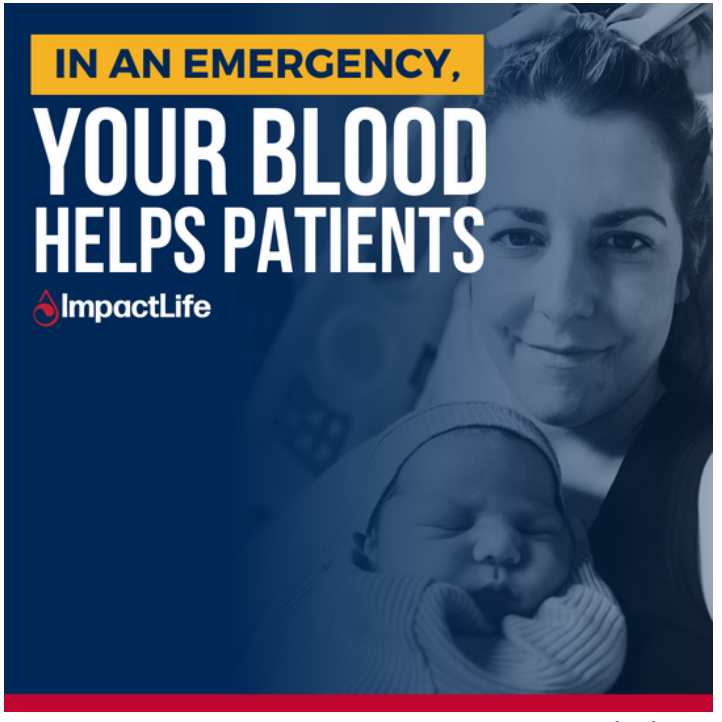
GIVE BLOOD It's trauma season Your blood can save lives. ♠ImpactLife

Share these on social media and tag us @impactlifeblood. #TraumaSeason #PartnerForLife #GiveBloodSaveLives