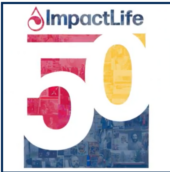
50 Years Logo Animation